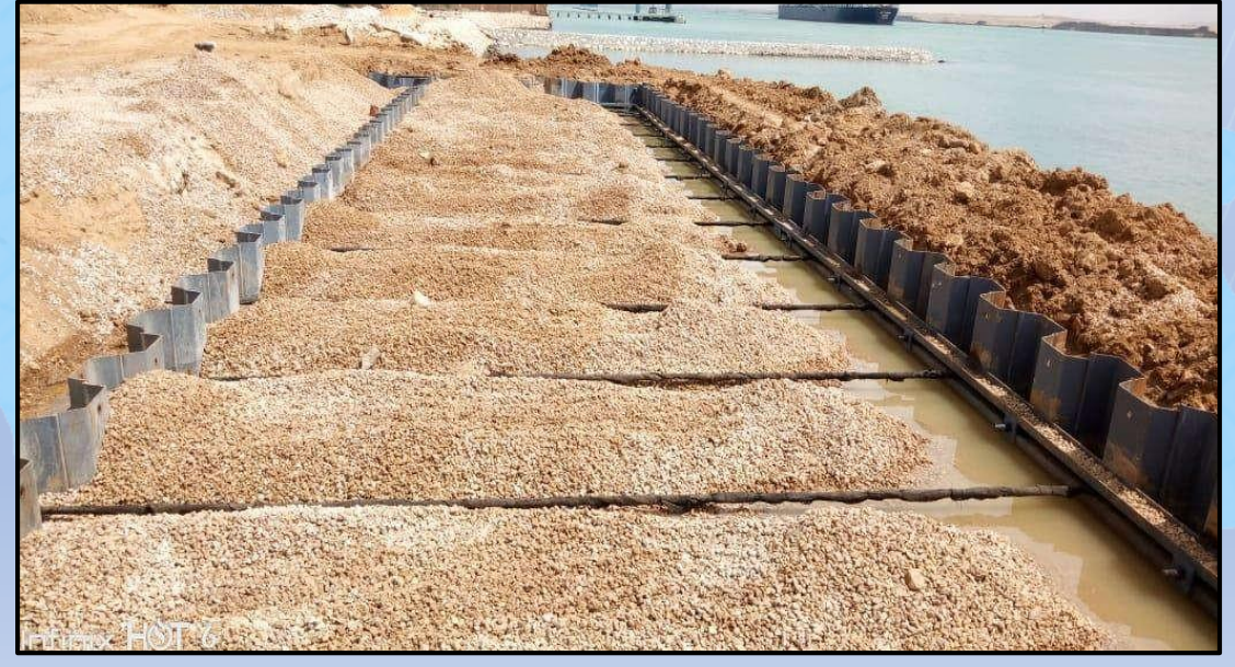
Tie roads works