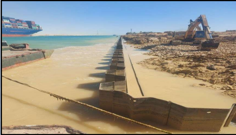
Utie roads works