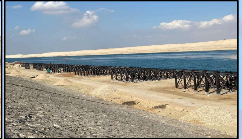
Final form of the project