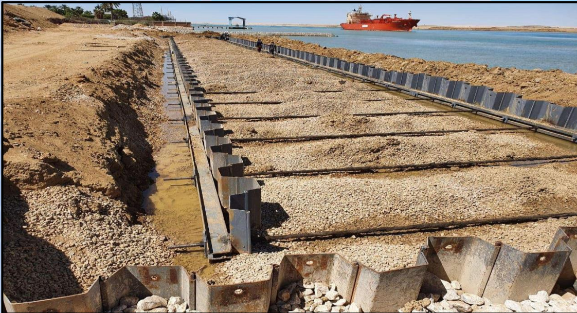
backfilling By crushed stone And aggregate