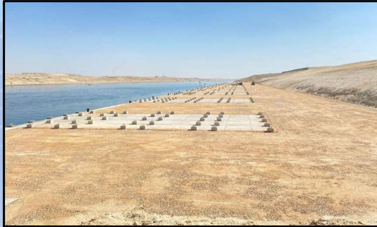
Final form of the project