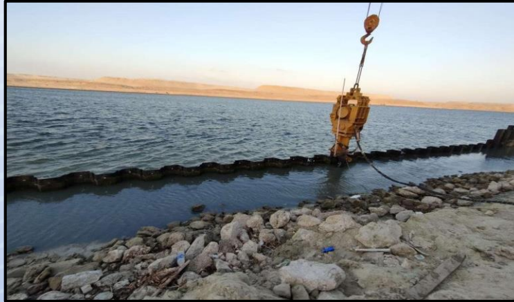
work of drilling the sheet piles