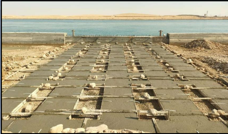
plain concrete for strip footing