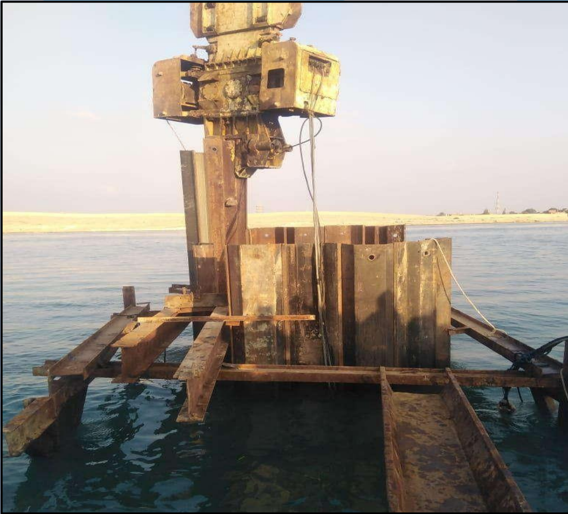
sheet piles work

2 Establishment of (5) upgraded dolphins in addition to (6) regular dolphins per kilometer